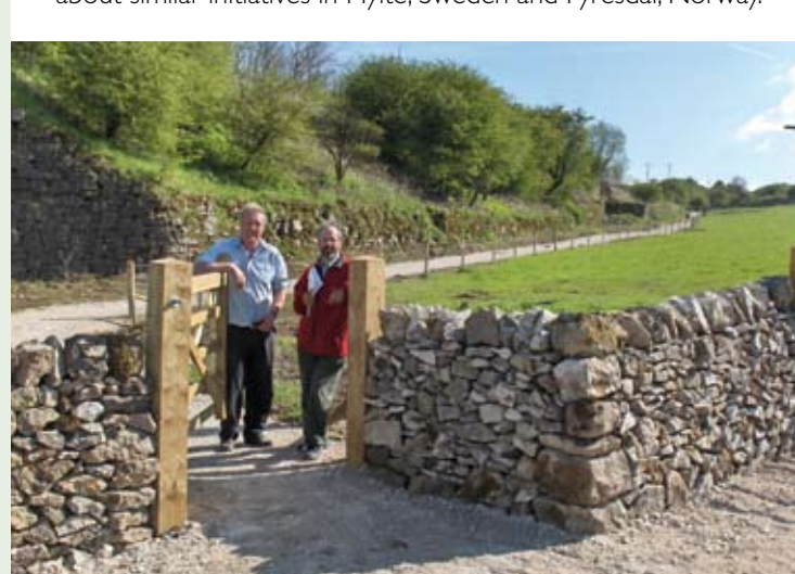
The new cycle-route from the High Peak Trail towards Hopton

Businesses throughout the area have joined BESST (listed over the page) to provide an extra-special experience in your visit - whether you're looking for somewhere to eat and drink, stay or shop. Visit www.besst.org for more details and to find out about similar initiatives in Hylte, Sweden and Fyresdal, Norway.