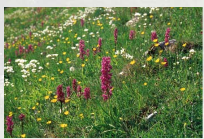
Flower rich Limestone daleside

You can walk, cycle or ride a horse on these routes all year round. Why not branch out and create your own circular route by using the greater network of public footpaths, bridleways and roads shown on the White Peak Ordnance Survey map (Outdoor Leisure 24).